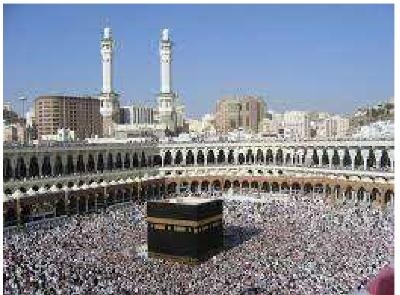
The Great Mosque in Mecca